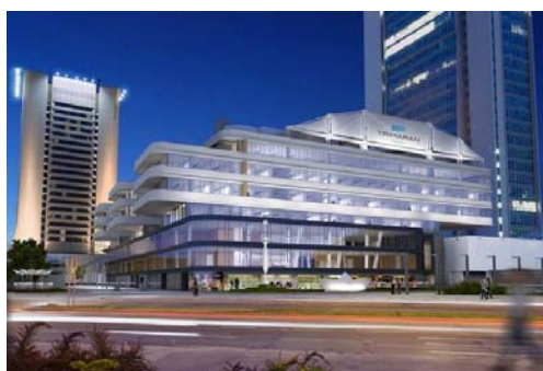
ICHC 2020 Conference Venue - Cubex Centre Prague

For more information about ICHC 2020, please visit: http://ichc2020.com/