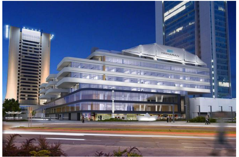
ICHC 2020 Conference Venue - Cubex Centre Prague

room contingent and the structure of the scientific program, the social program and procedures for selecting topics and honorary lecturers were taken which makes a more detailed planning of the event possible. It is our great pleasure to extend a warm invitation to everyone to attend what is sure to be a memorable conference. There will be, as usual, emphasis on supporting our younger conferees. We hope to welcome you to Prague and the great ICHC 2020! Plans for 2019: The 60th Symposium of the Society for Histochemistry is preliminarily planned as a session of the COST “Nuclear Organization and Lipids Involvement in Gene Expression” conference to be held on 23-25 October in Prague, Czech Republic.